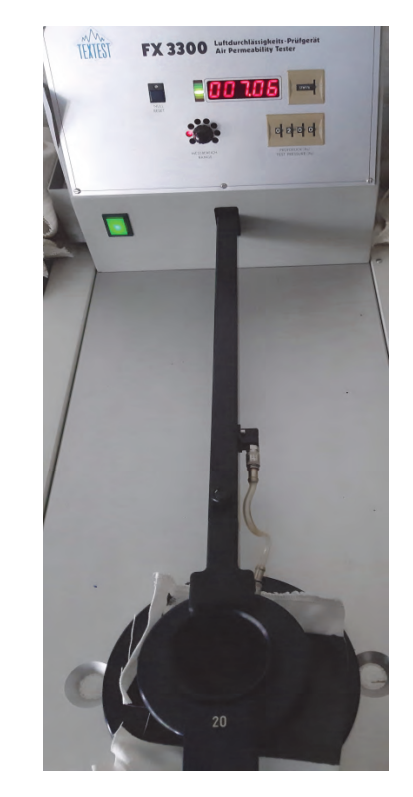
Fig. 2.1. Air permeability test – Ni sample no. 1

Even if the sample treated using Ag has an excellent surface resistance, the Ag is very expensive and will generate a higher cost for the electromagnetic shield obtained.